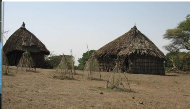
Typical homes in Langanu

Experiences like this during a trip to Ethiopia in April 2011 confirmed that we feel called to live and serve overseas. Now, after years of thinking about it, we're finally moving to Ethiopia, East Africa! Together with SIM, an international mission organization, we will share the love of Jesus, encourage and teach people who want to learn more about God, and provide medical care in an extremely underserved area. We plan to serve in Ethiopia long-term, but our initial commitment with SIM is for two years.