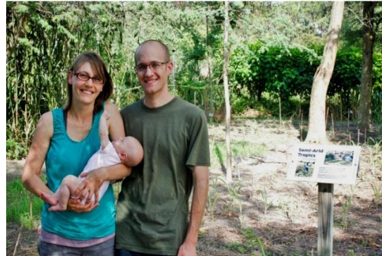
At ECHO in the semi-arid farm plot, similar to the land in Langanu.

How do communities like this work together to overcome unpredictable rain, wandering goats, poor soil, and other difficulties? How does faith relate to farming and health? October 1 st -5 th we spent an amazing week wrestling with these questions at a conference held at ECHO Global Farm in Fort Myers, Florida. ECHO partners with rural farming communities and national churches in developing countries to share information, techniques, seeds, and work together to solve agricultural problems.